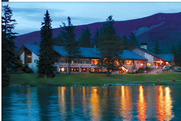
The Fairmont Jasper Park Lodge in Alberta offers cedar chalets and log cabins.