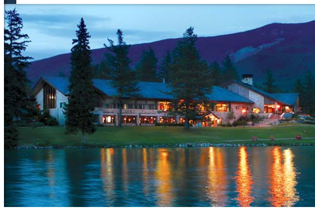
The Fairmont Jasper Park Lodge in Alberta offers cedar chalets and log cabins.