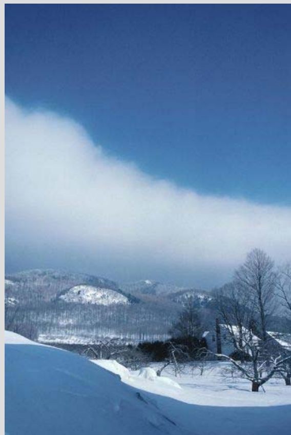
SNOWCOVERED SCENE: A village in the Canton de l'Est, or Eastern Townships, in the mountains in Quebec, Canada

I think I'll have the fish soup Marseillaise—no, seared duck thigh sounds nice. No, make that hake, I love white fish—no, what do you think of the pan-seared la Carnadière farm duck leg?