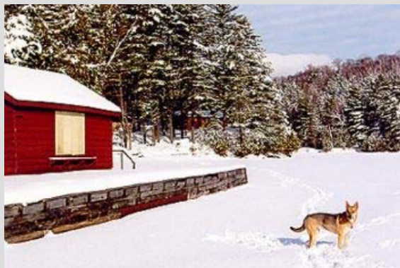
LAKESIDE: Echo Bay, Lake Memphremagog